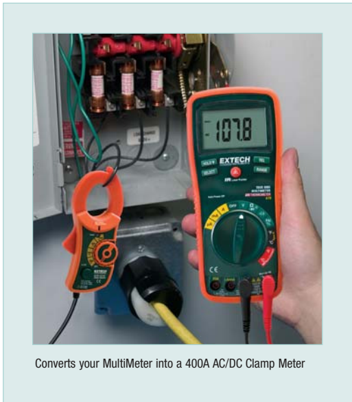
Converts your MultiMeter into a 400A AC/DC Clamp Meter