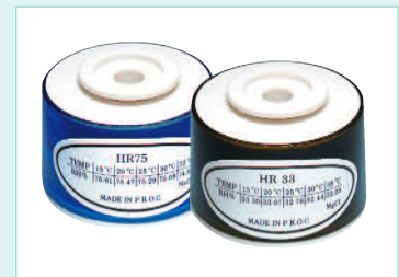
RH300-CAL Optional calibration salt bottles