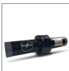
ElectroStop® Monolithic Isolation Joint