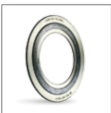
FLEXSEAL® SWI Spiral Wound Gasket