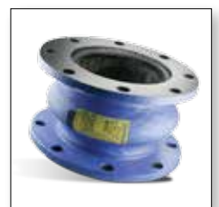
Style 204 Expansion Joints