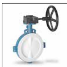
GAR-SEAL Butterfly Valves