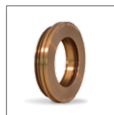
KLOZURE® Dynamic Seals