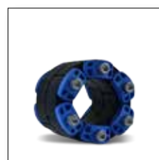
LINK-SEAL® Wall Penetration Seals