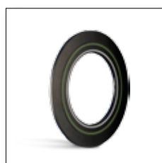
VCFS Fire-Safe Flange Isolation Kit